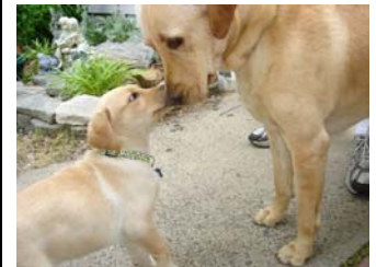
Marcia and new guide dog puppy Tillie get acquainted